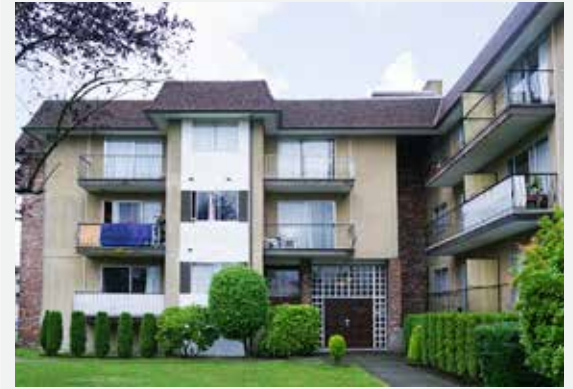
WALKER MANOR 6947 WALKER AVENUE, BURNABY