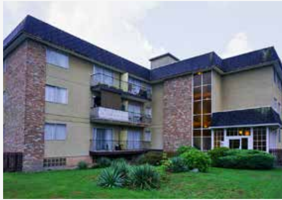
KARIN MANOR 7230 ELWELL STREET, BURNABY